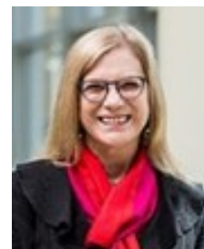
Elizabeth Rose Professional Achievement Awards

The award will be announced and presented to the winner at the IM Division business meeting at the 2020 AOM annual meeting